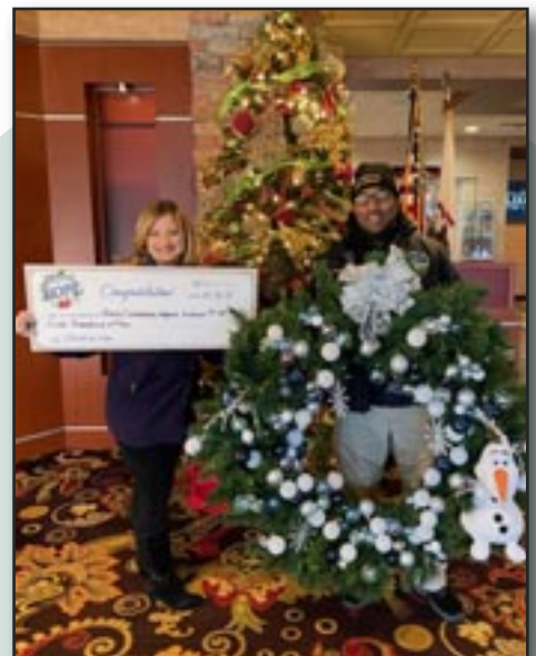
We were honored by Par-a-Dice Hotel & Casino to be one of five organizations in their Wreath of Hope contest.